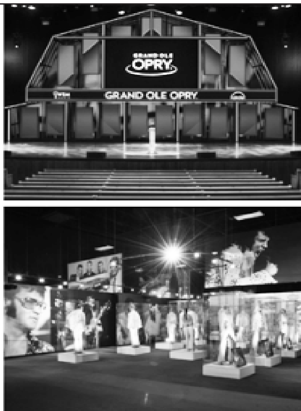
Clockwise (L to R): WildSide in the Smokies, Grand Ole Opry in Nashville, Elvis Presley's Graceland in Memphis.

Tennessee promises unique, immersive experiences and outdoor adventure in 2025 with new attractions, restaurants, distilleries, hotels, exhibits, iconic anniversaries and impressive renovations.